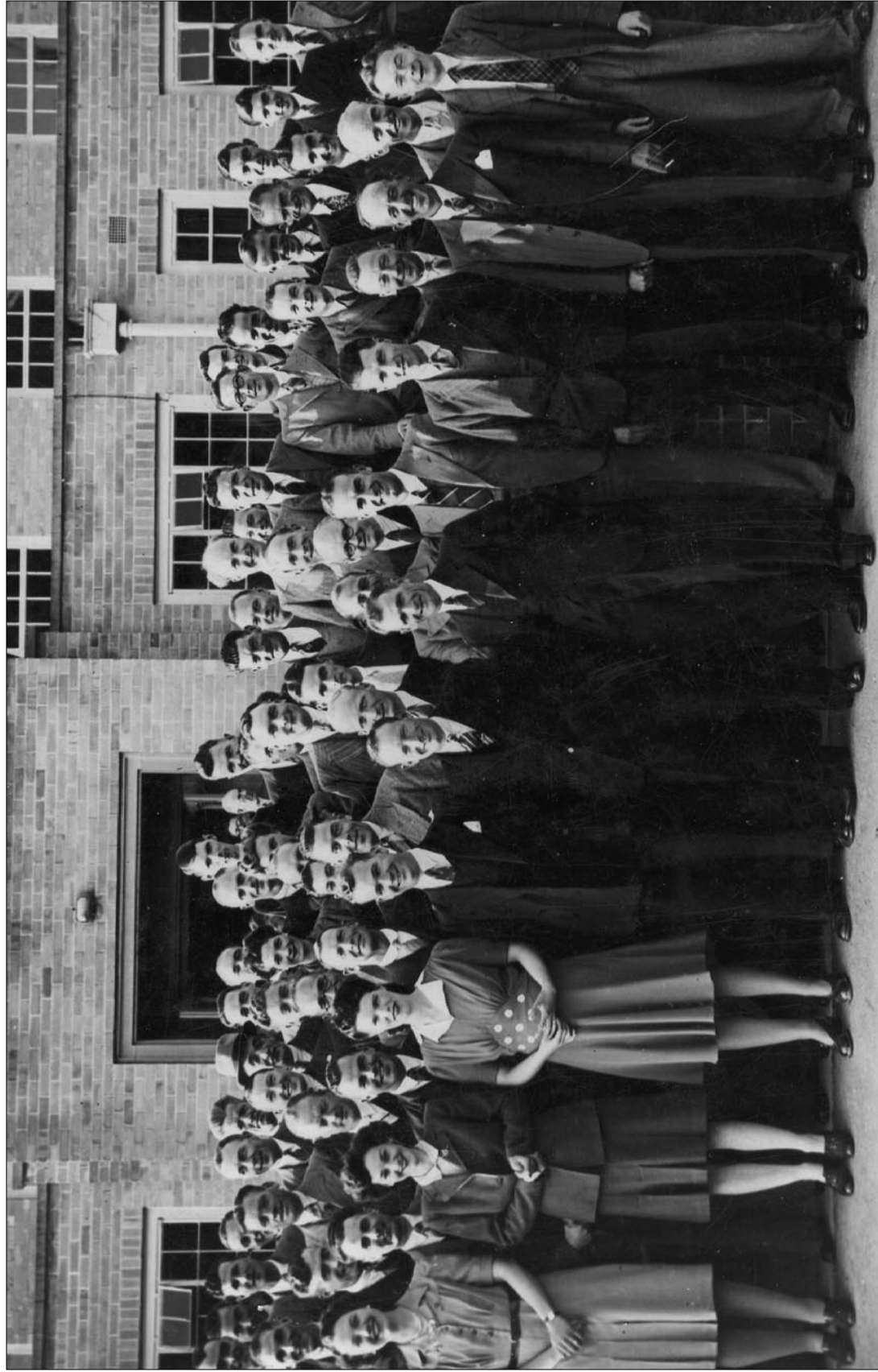
“Welcome Home” - first demob held at Stanchester School 1946.