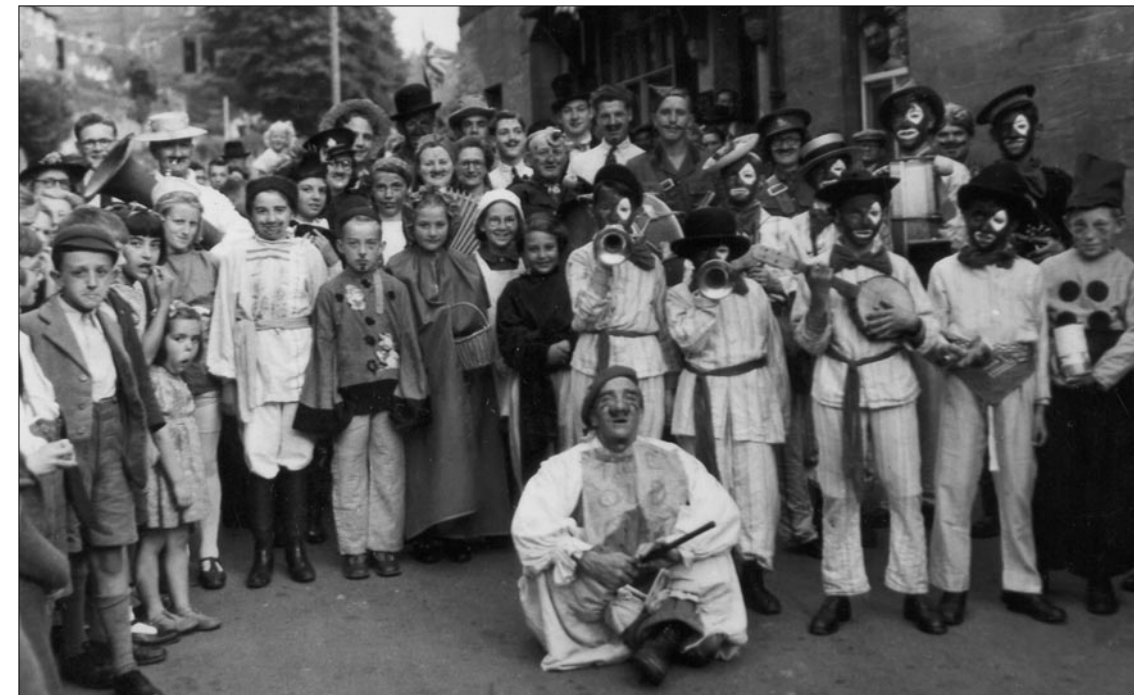
V.E. Day 1945 outside the Half Moon Inn.