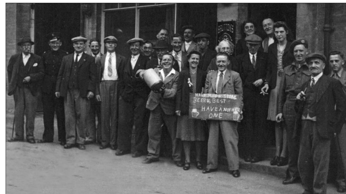
VE Day 1945 at the Half Moon Inn.