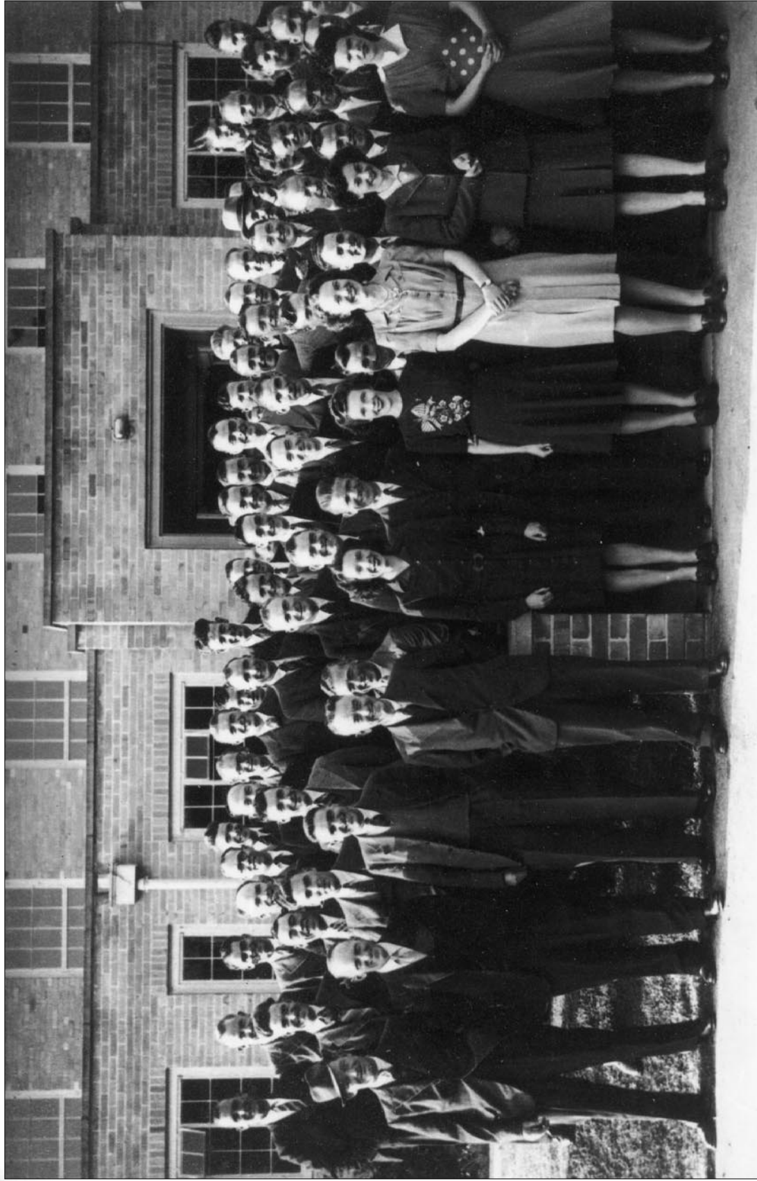
“Welcome Home” - first demob held at Stanchester School 1946.